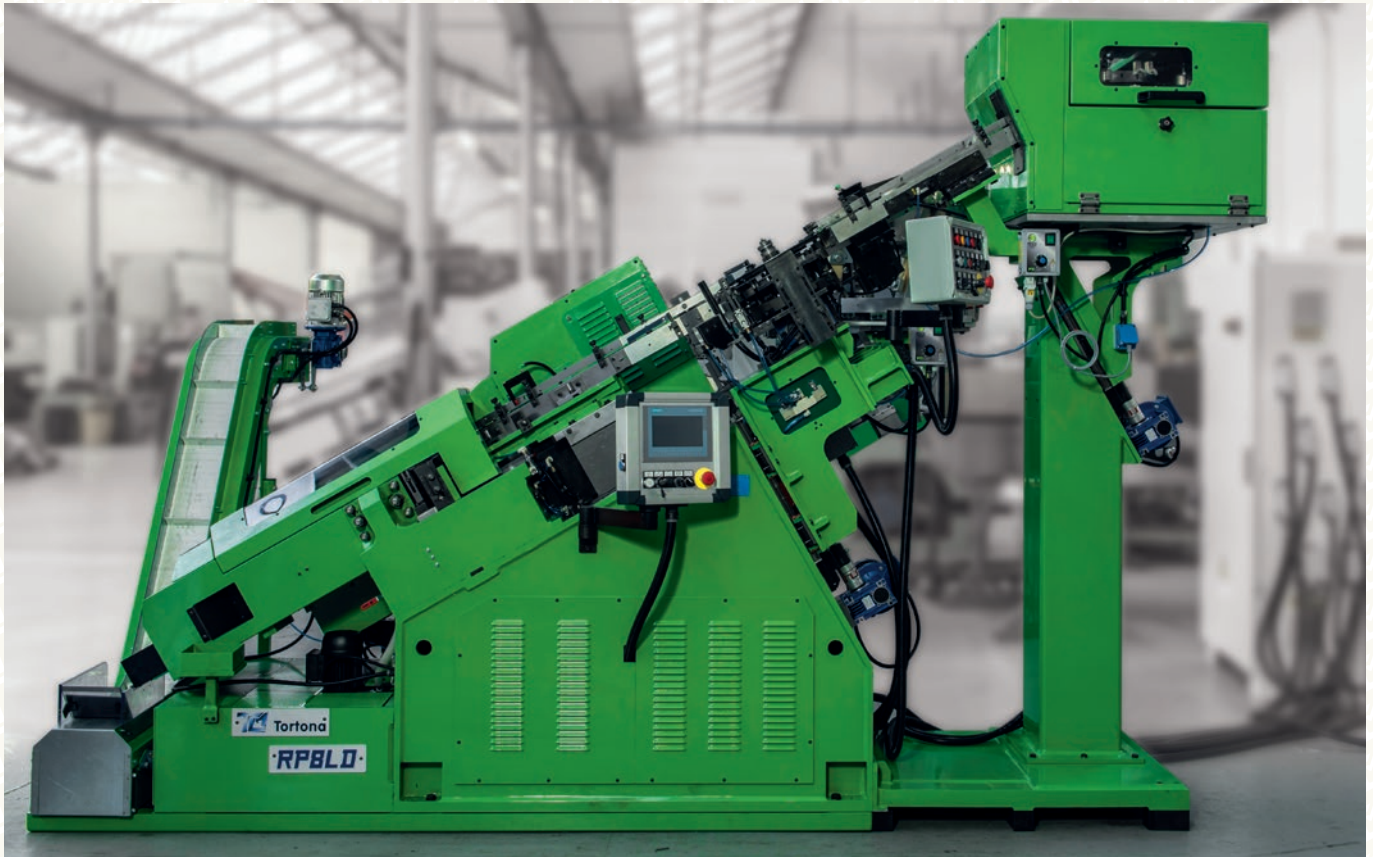
RP8LD with roller block slide in combination with special bushing loader. Bushing loading and rolling up to diameter 16 mm.