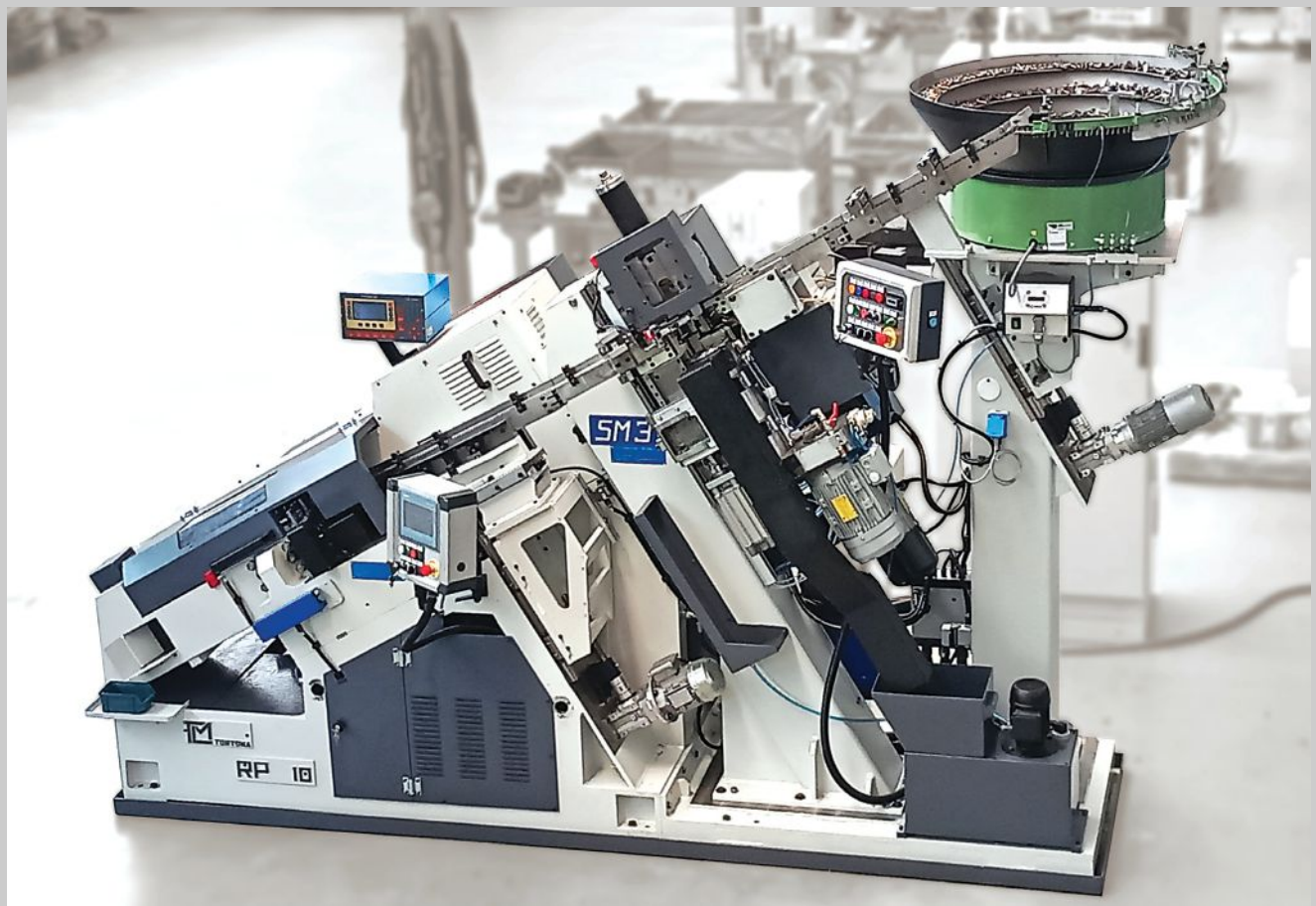
RP10LD Thread rolling machine with SM3 Pointer.